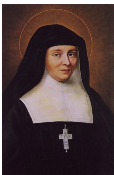
St. Jane de Chantal, 1572-1641 Founder